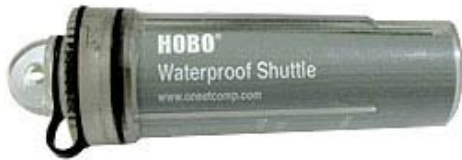
U-DTW-1 Waterproof Data Shuttle